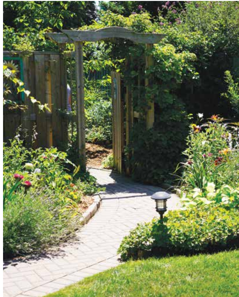
▲ Sue Gemmil's front garden bed is a punch of gorgeous English country style. The shady back garden includes the striking native Cup Plant.