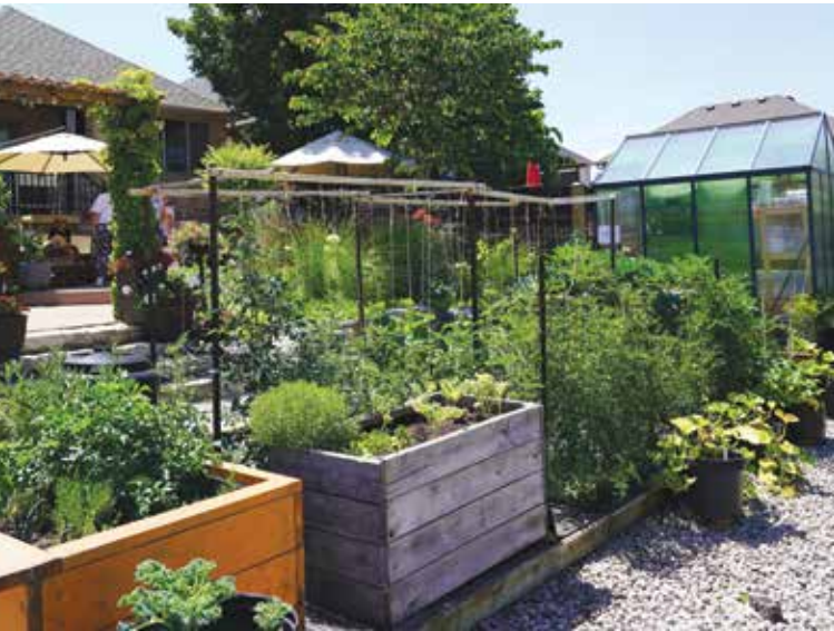
▲ A large patio looks onto richly planted raised vegetable garden beds in the Fishers' yard.