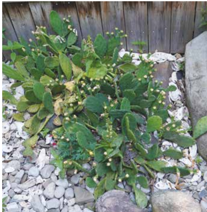
▲ A native Prickly Pear cactus is thriving and blooming in the Mackenzies' garden.