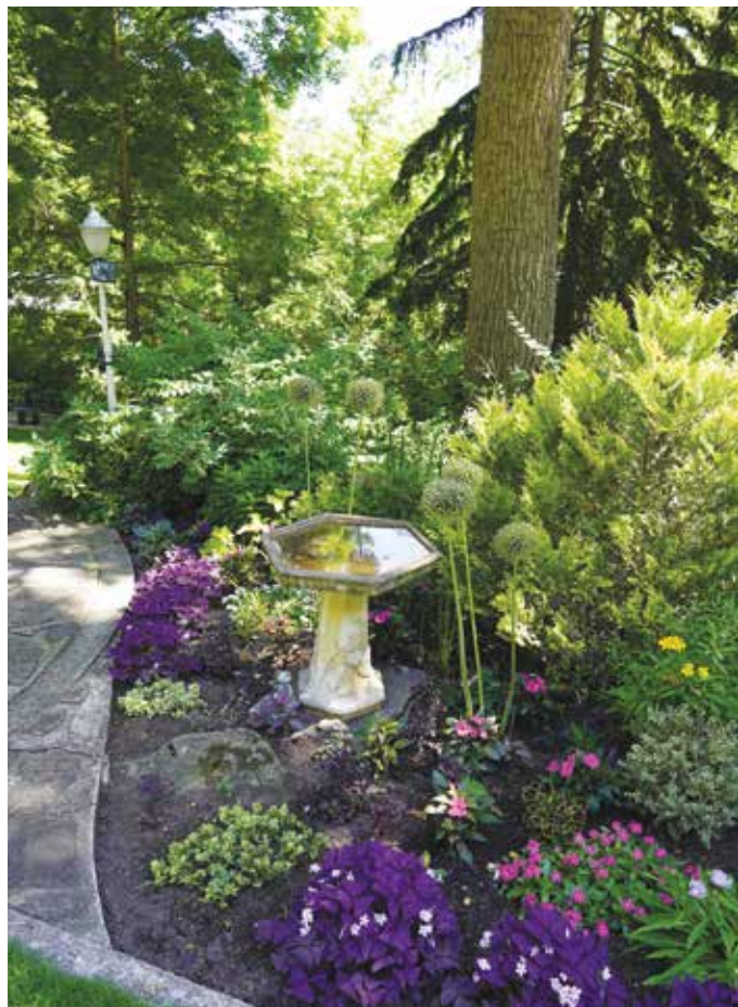
▲ Just one striking idea from the almost-two-acre garden of the Holbournes is the use of Oxalis shamrocks as edging plants.