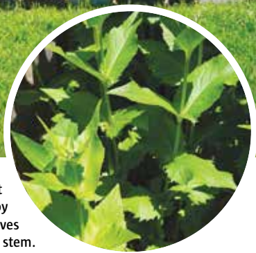
► The Cup Plant benefits wildlife by holding water in leaves at the base of the stem.