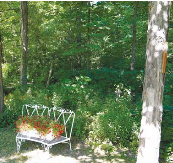
▲ Front and back, the Mackenzies' property is shaded by 27 species of trees.