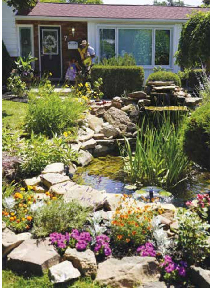
▲ A small waterfall and pond, surrounded by rocks and beautiful plants, delight the eye in the front garden of Ruxandra and Alex Bucataru.